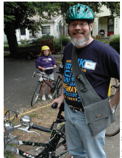
Portland By Cycle rides help people new to cycling get experience they need on the roads

During the 1970s, there were plans to build an expressway through the city of Portland. The community collaborated to have a light rail system for public transit built instead. The introduction of this light rail led to an increase in the number of trips to the city center. The downtown area grew from 5% of the city's total retail to 30% because houses and businesses were built where parking lots would otherwise have been needed. The city has now developed a plan to control outward growth and redirect it towards the city center by ensuring that 85% of all new growth is within a five minute walk of a transit station.